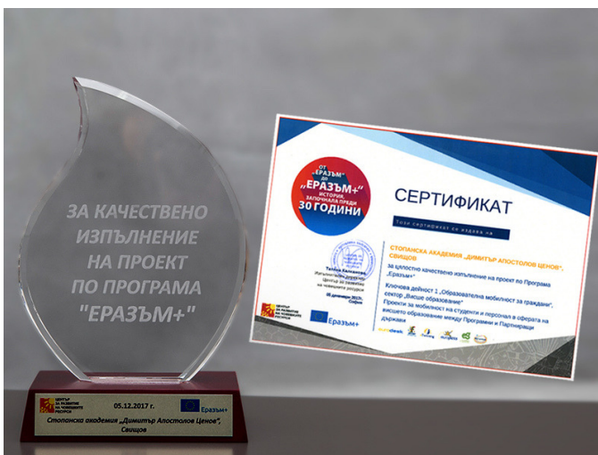
Quality implementation of Erasmus+ project